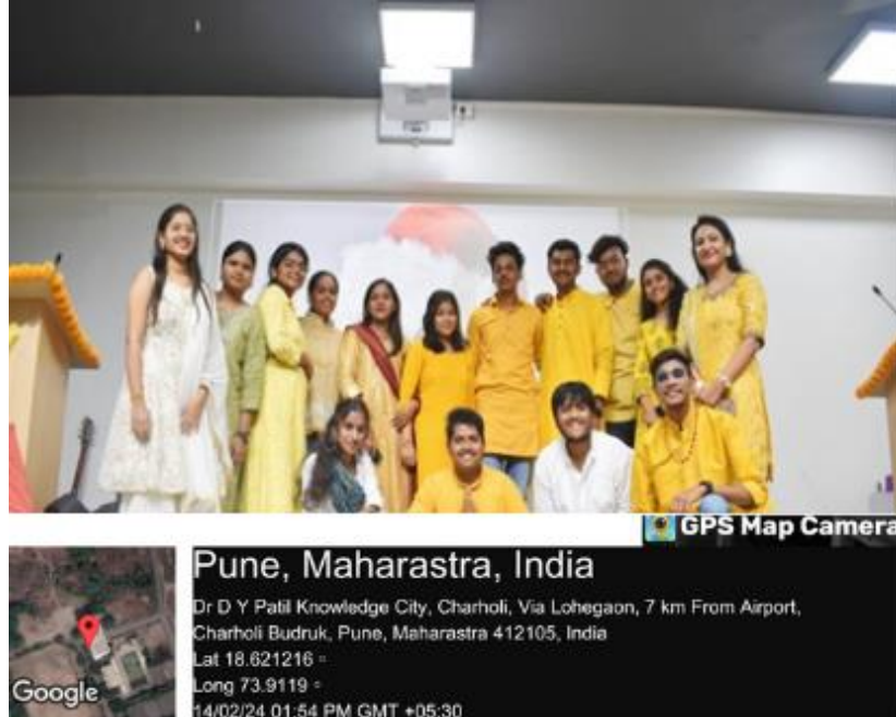
Students participating in the event